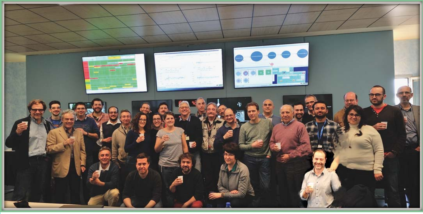
Toasting the locking of the interferometer