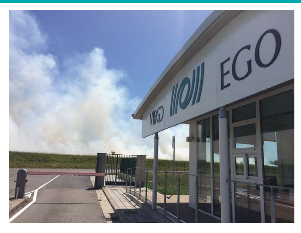
7-June: A fire during a windy day, approaching the EGO main entrance

Our site is vast, so detecting the beginnings of a fire is not such an obvious task, but, thanks to the descriptions made by our external security personnel on site and the interventions of members of the EGO first-aid team, firefighters succeeded each time in controlling the flames and fumes that could have deteriorated the air filters of our experimental buildings, making them ineffective.