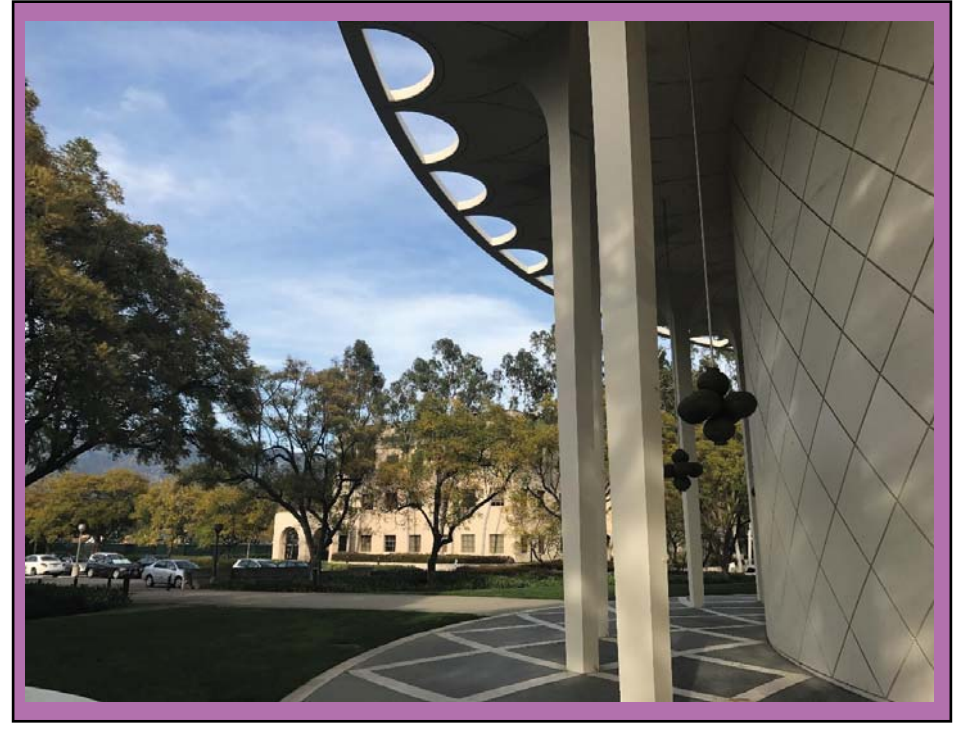
The Beckman Auditorium, one of the symbols of Caltech

New master oscillators for future interferometers, cryogenically cooled and with longer wavelengths (2000 nm) with respect to the standard 1064 nm, are being developed [3].