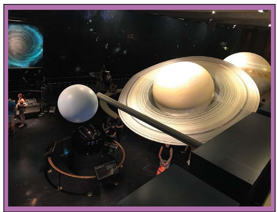
Inside the Griffith Observatory