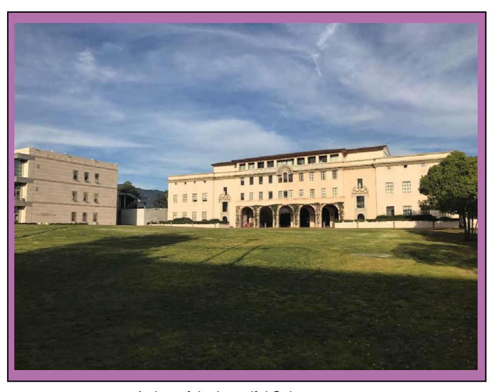
A view of the beautiful Caltec campus

Squeezing in advanced detectors is now a reality: a squeezer is